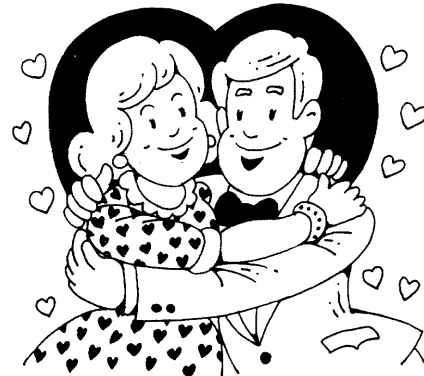
Happy Valentine's Day!

Saturday, October 21, 7:30 p.m. 20th annual Roar with Laughter Hispanic Cultural Center, 1311 E. Wadley